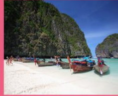
Krabi (Koh Ngai, Phi Phi, Railay)