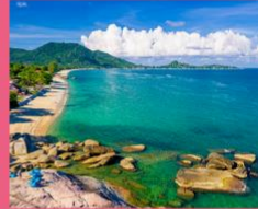
Koh Samui Koh Phangan Koh Tao