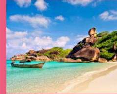
Phang-nga (Khao Lak, Koh Yao)